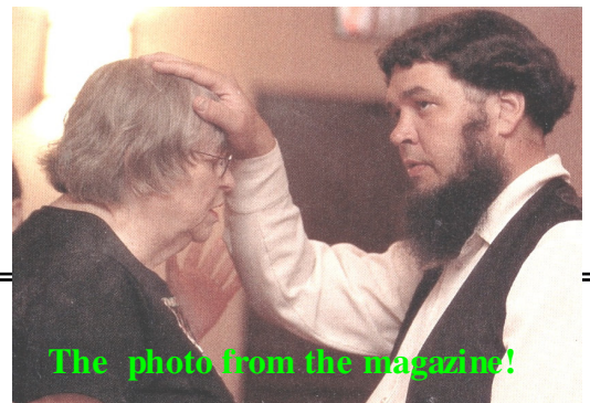
The photo from the magazine!

time invested to ensure that His Church is there to meet the need of the world.