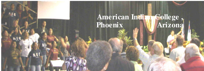
American Indian College , Phoenix Arizona