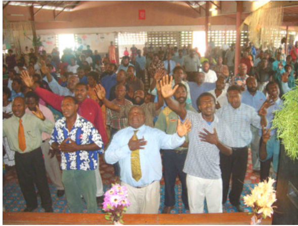
Passionate response of PNG Ministers to God's Call to a lost World and re-launch of "Carry the Light International"