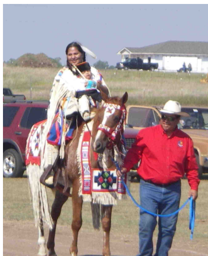
Comanche Nation Princess at National Tribal Council Headquarters, one of the venues where we preached in Lawton OK .USA