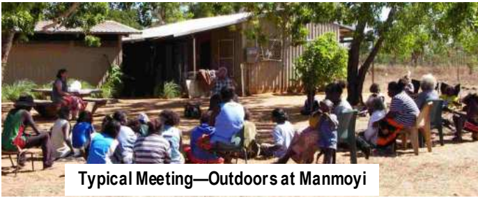
Typical Meeting—Outdoors at Manmoyi

understood a little of their language or more likely because of the age and roughness of my vehicle and clothes. As soon as I mentioned the invitation by the traditional owner, now a couple of years old, the whole community gathered around for an impromptu meeting. As people were gathering I began to complement the old man on the fineness of the artwork he was painting on a carving that seemed destined for the tourists in the Maningrida art and craft shop. Rather than receive the complement he gestured disparagingly towards the carving and said in Kriol "It's a Mimi spirit. It's Rubbish one" (a Mimi spirit is sort of the Arnhemland version of a vampire ). I am still struck by the desperation in his voice as he despaired "What we want is someone to come and share with us the good news about the creator!"