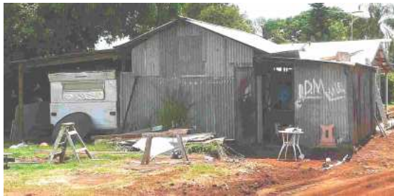
But don't think you've missed out on all the fun! Shed-Workshop repair / extensions have just begun! See p5

THANKYOU to all who have blessed us with prayer, finances, time and encouragement .