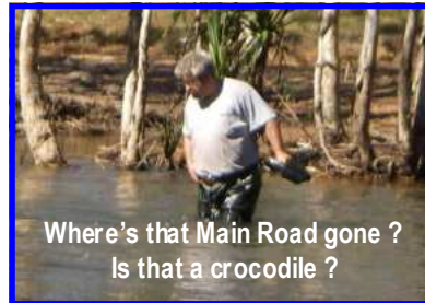
Where's that Main Road gone? Is that a crocodile?

We are beginning to see the fulfilment of the "word" that God had given me the night this whole community committed to Christ-that to God's plan and purpose for Manmoyi was to become a fishing village from which they would launch out and fish for men, returning simply to mend their nets and care for their families.