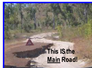
This IS the Main Road!

There is still much work to do. On the way to Manmoyi when passing another small outstation called Mumega I remembered that some years ago I had met an old man who loved the Lord, at a Uniting Church Convention in Maningrida. He had asked me to visit this outstation which was his homeland. Both he and his wife were now living in the larger community of Maningrida to be close to medical care. Each time that I have passed that way with local believers they have warned me against going in there because of secret ceremonies. On this occasion as I was travelling