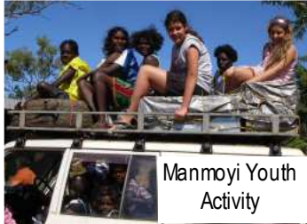
Manmoyi Youth Activity